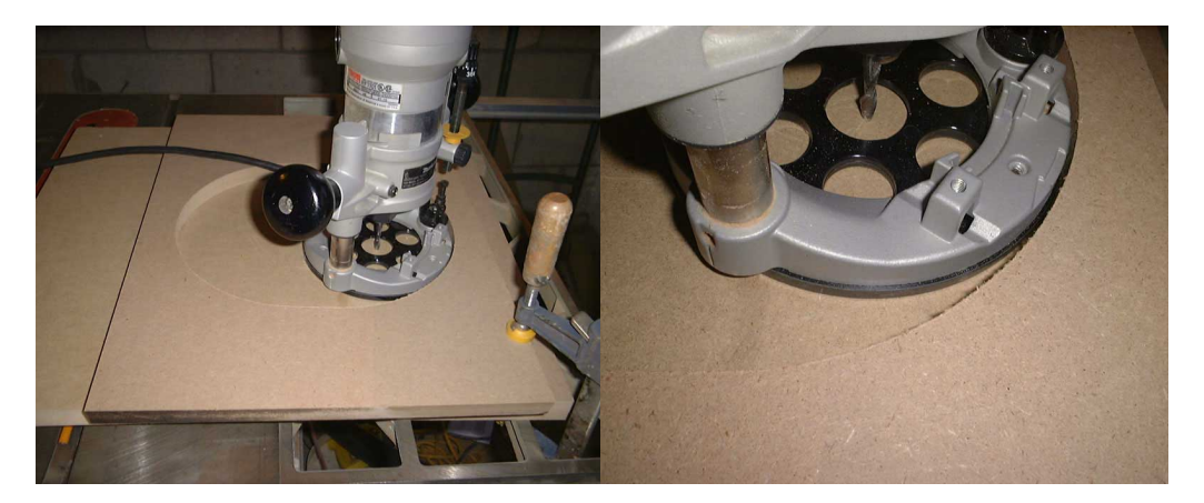
Step 2: With 1/4" spiral bit, use template #1 to make template #2. Pass router several times around the inside of template #1 until it completely cuts through.