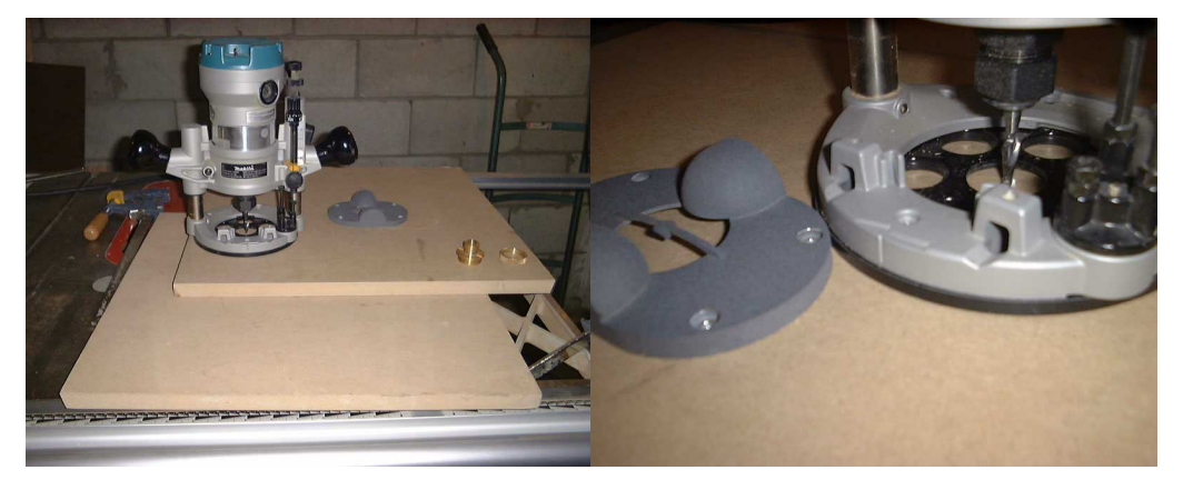
Step 1: Screw down driver plate onto scrap MDF (this is template #1) large enough for the router base to go around the parameter of the driver plate. Firmly clamp down everything onto the work bench. With 1/4" spiral bit, firmly route against the driver plate a few times until it completely cuts through the MDF. It's imperative to always keep the router base firmly pressed against the driver plate at all times until it completely cuts through template #1. An extra scrap piece of MDF must be placed under template #1 to prevent unwanted table top damage. :-) Making template #1 is the most critical part. Everything else will be a breeze!