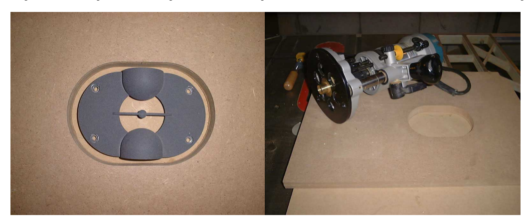
Step 3: As you can see, template #2 is exactly 1/4" wide around the parameter of the driver plate. Attach the 3/4" bushing and use template #2 to create the actual recessed baffle. The depth and hole required is dependant on the specifications of the speaker driver. Be aware that template #2 is 1/4" wider around the parameter of the driver plate and adjust location accordingly on actual speaker baffle to route.